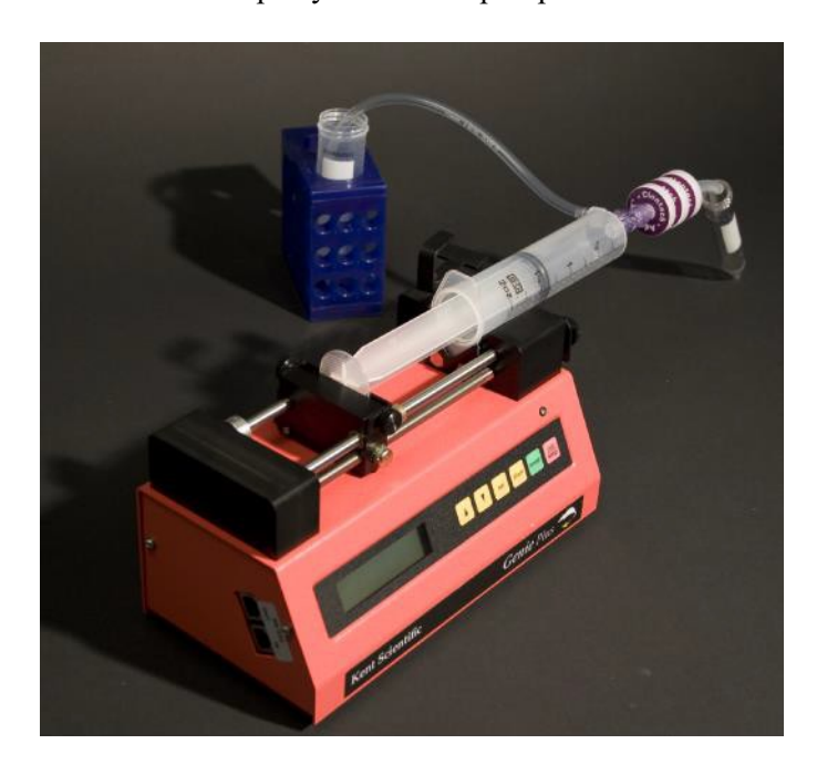
Figure 3. Placement of the Adeno-X Purification Assembly on an infusion pump. A pump from Kent Scientific isshown, but any infusion syringe pump will work.