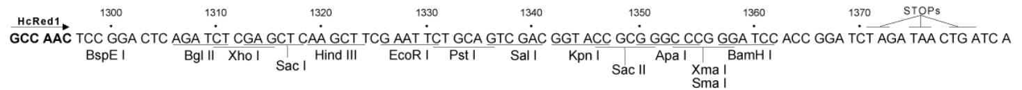
pHcRed1-C1 vector map and multiple cloning site.